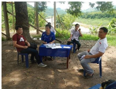
Contract signing with the community and the contractor