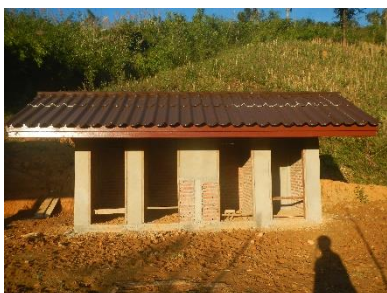
Four new toilets are a big improvement to the hygienic conditions