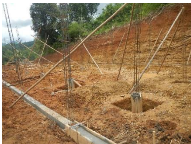
The foundation is set