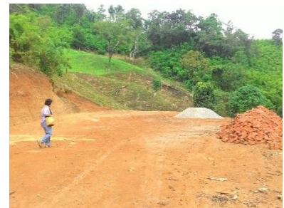
The property is already prepared for the new school building