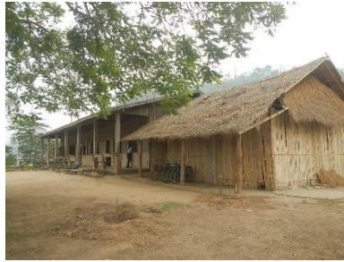
The primary and secondary students had to share the concrete building (far left building)