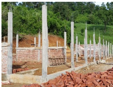
We are pleased with the smooth progress