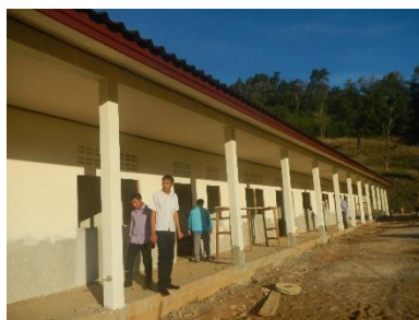
The new school building with six fully furnished classrooms is finished! Thank you for your support!