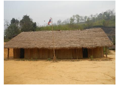
Some of the primary students were moved to this thatched bamboo building