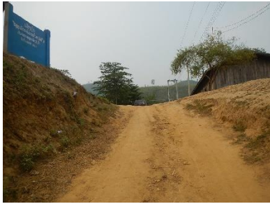
Welcome to Samakkeexai Lower Secondary School