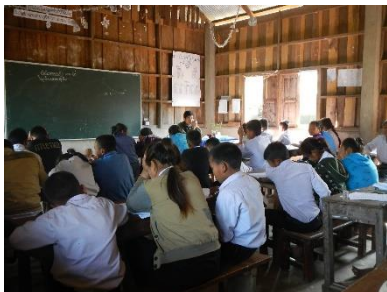
The classrooms are overcrowded and the number of students is expected to increase in the coming school year