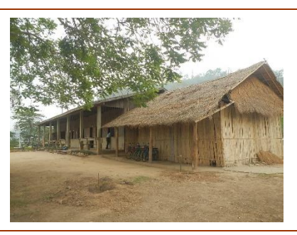
The primary and secondary students had to share the concrete building (far left building)