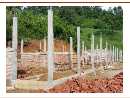
We are pleased with the smooth progress