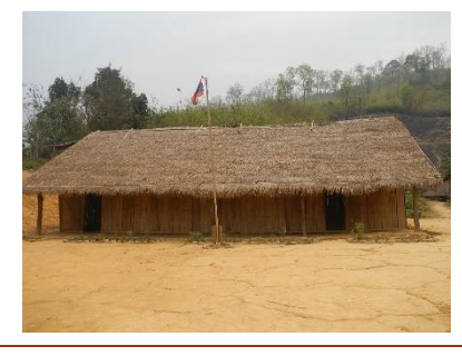
Some of the primary students were moved to this thatched bamboo building