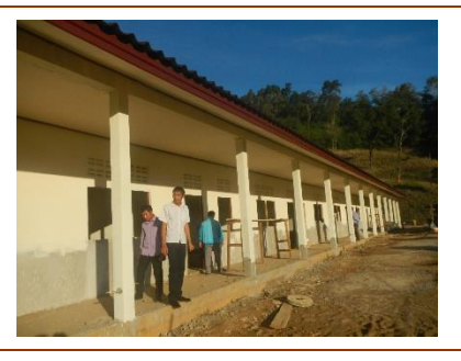
The new school building with six fully furnished classrooms is finished! Thank you for your support!